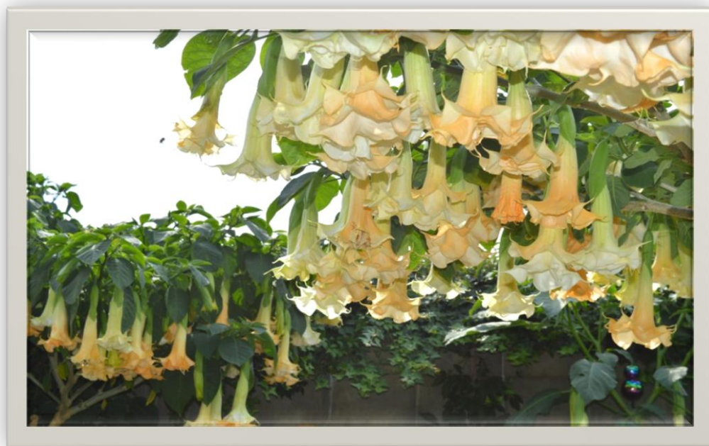
Above: B. 'Angel's Face'