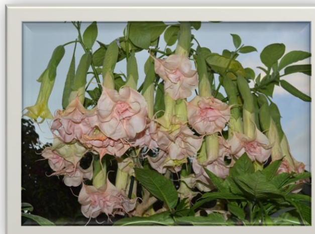
Above: B. 'Bergrose' (L) and Diebsteinperle (Rt)