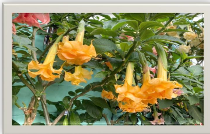
Below: B. 'Zitronenkonig'