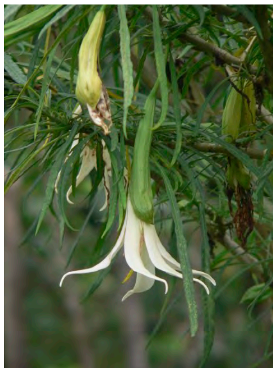
Fig. 1. B. ‘Culebra’ — photo A. Hay.

The best-known of these, amongst collectors outside Colombia, is of course Brugmansia ‘Culebra’, with very narrow, almost strap-shaped leaves and the corolla divided into separate petals, which Bristol’s mentor, the celebrated