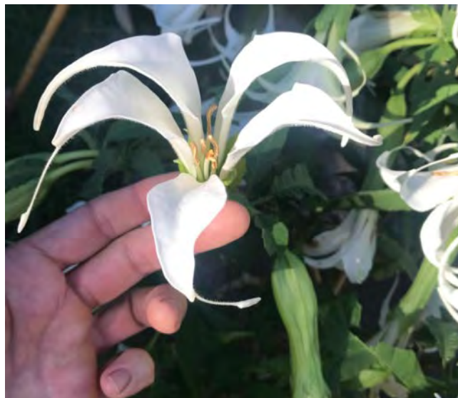
Fig. 3. B. ‘Kraken Blumen’ — photo D. Williams.

South Wales has crossed ‘Culebra’ with normal forms, and he too has found that the F1 offspring are all outwardly normal. Crossing the siblings however, D.W. produced about 10% of F2 offspring with extremely narrow leaves and all had flowers with separate petals. The cultivars ‘Spirit