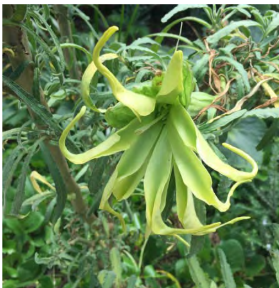
Fig. 2. B. ‘Spirit Fingers’

one more vigorous than the other (Hay et al., 2012: 98), and what is possibly another has been reported from Pacto, in Pichincha Province, Ecuador (Nicholson, 2002). It is not clear how many of these ‘Culebra’ clones are in cultivation outside the northern Andes, though at least one has been repeatedly introduced to cultivation in the USA and UK and thence further afield since the 1950s. Yet another mutant form which resembles ‘Culebra’, but with the calyx divided into almost separate sepals in addition to having separate petals, and with slightly less narrow leaves, was recorded in 1955 near Tumaco on the Pacific coast of the Department of Nariño, virtually at sea level, and a specimen is preserved in the Colombian National Herbarium in Bogotá (Hay et al., 2012: 98, fig. 3.2). Whether it still exists in the living state is not known, and unfortunately Tumaco remains a risky place to visit, being an area of ongoing violent conflict.