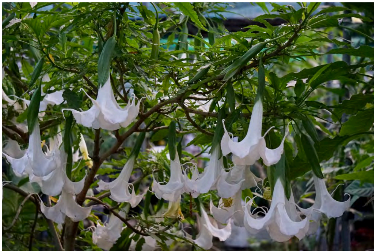
Brugmansia 'Taita's Gift' — photo A. Hay. Next issue will have part 2: Hybridising with different mutant cultivars, descended from 'Quinde'.