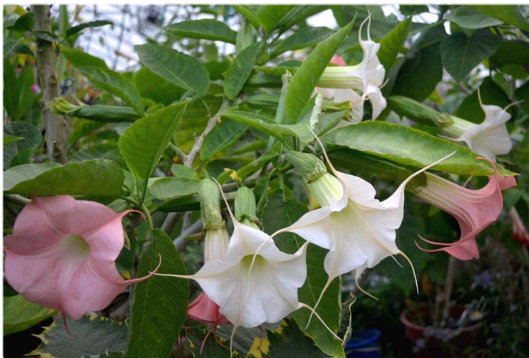
Brugmansia 'Rothkirch'

Brugmansia with what we had at hand. Our first hybrid to keep was 'Cher Chez la Femme'.