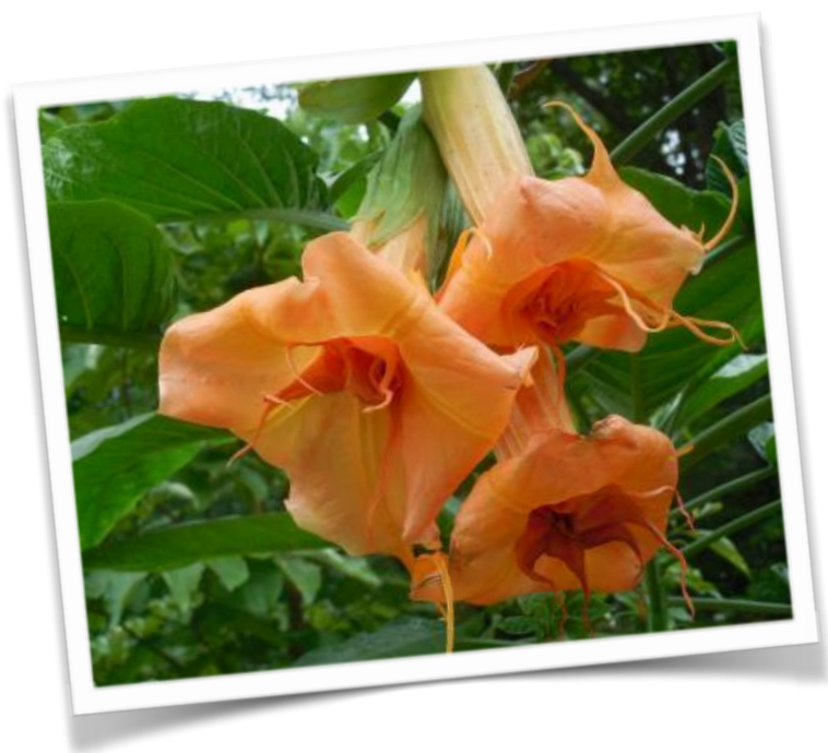
Brugmansia 'Miss September'

I remember helping her start seeds and working in the gardens from very young. As children, we were given our own garden spaces and taught to grow plants from seed. It's amazing what a child can learn just by being with and helping her parents and grandparents. Before even into my teens I knew much about growing roses and other plants, and more about gardening than most adults.