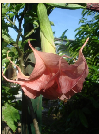
Fleming Island Rachel