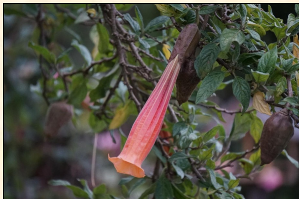
Orange B. vulcanicola

Here are some more from La Cocha. We went down a road we've not been down before... it was definitely worthwhile! An orange vulcanicola, another pink, a nice vulsa hybrid, and the strange yellow fruit of one which had no flowers, but which seems to be different as it is quite hairy on the shoots.