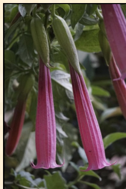
Pink B. vulcanicola